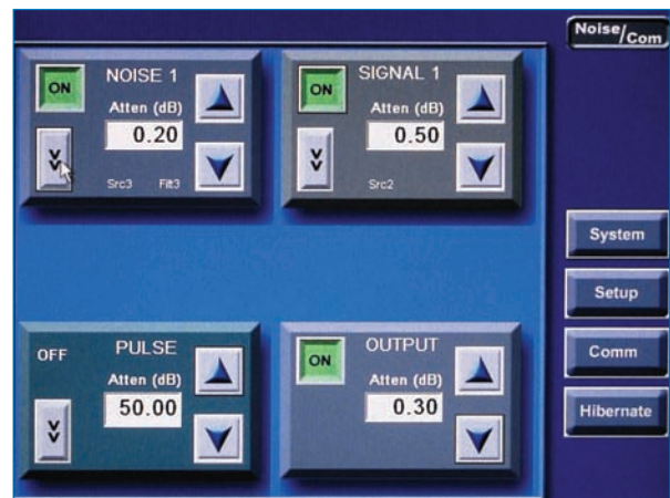
Intuitive standard control menu